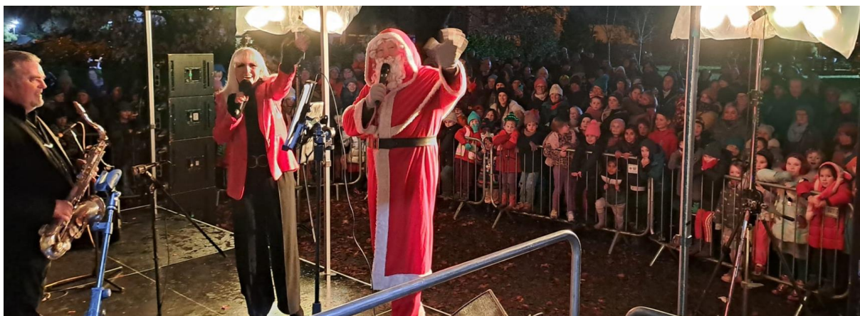
Harolds Cross Christmas tree lighting ceremony

The Crumlin and Terenure event was well attended with over 1000 participants and the Kimmage and Harold's Cross lighting ceremonies had approximately 500 attendees each.